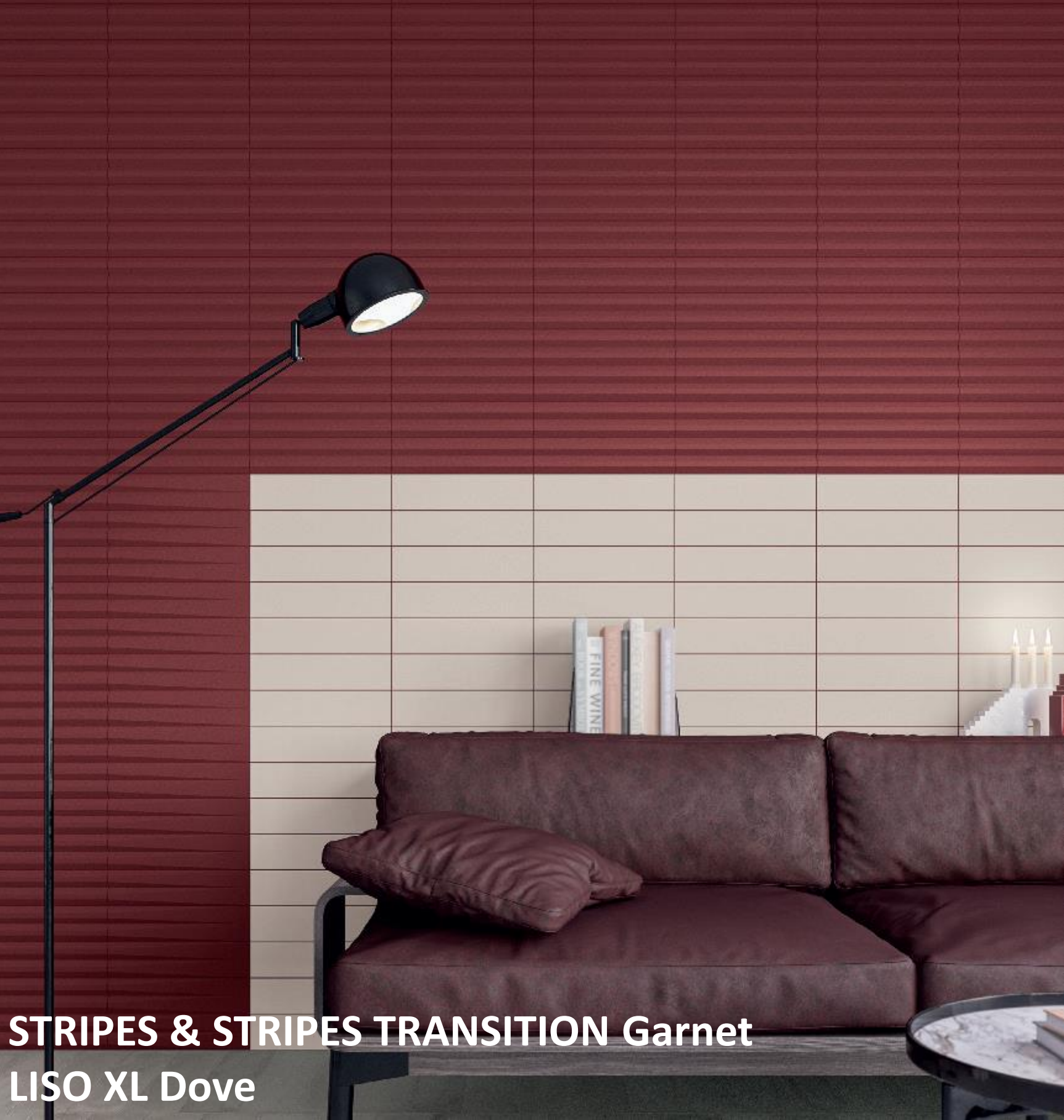
STRIPES & STRIPES TRANSITION Garnet LISO XL Dove