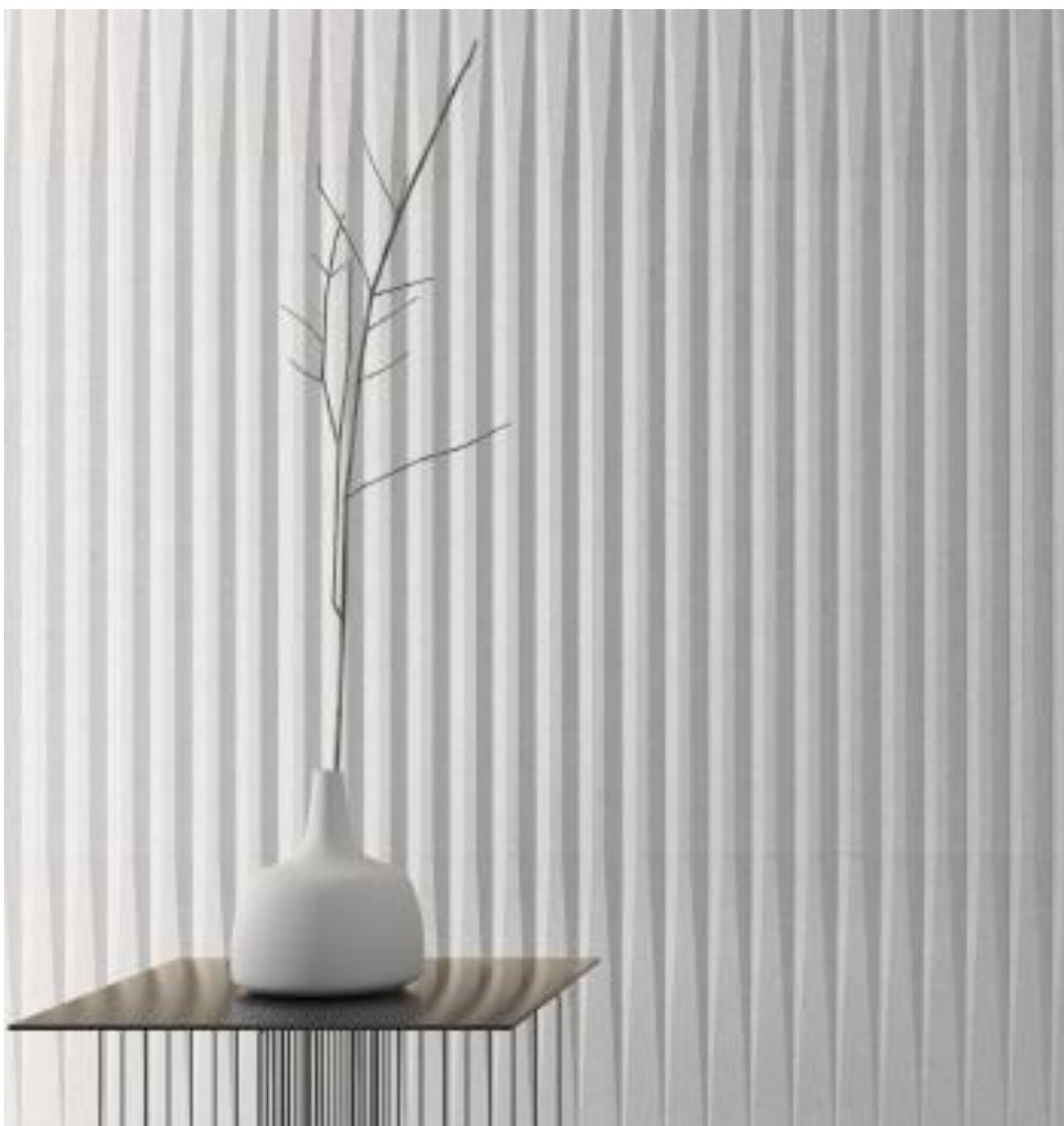
STRIPES & STRIPES TRANSITION White Stone