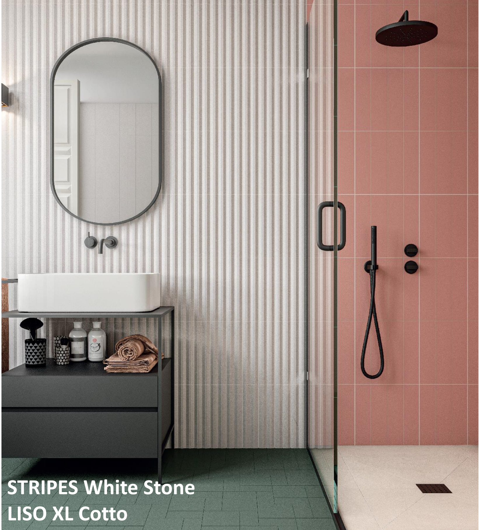
STRIPES White Stone LISO XL Cotto