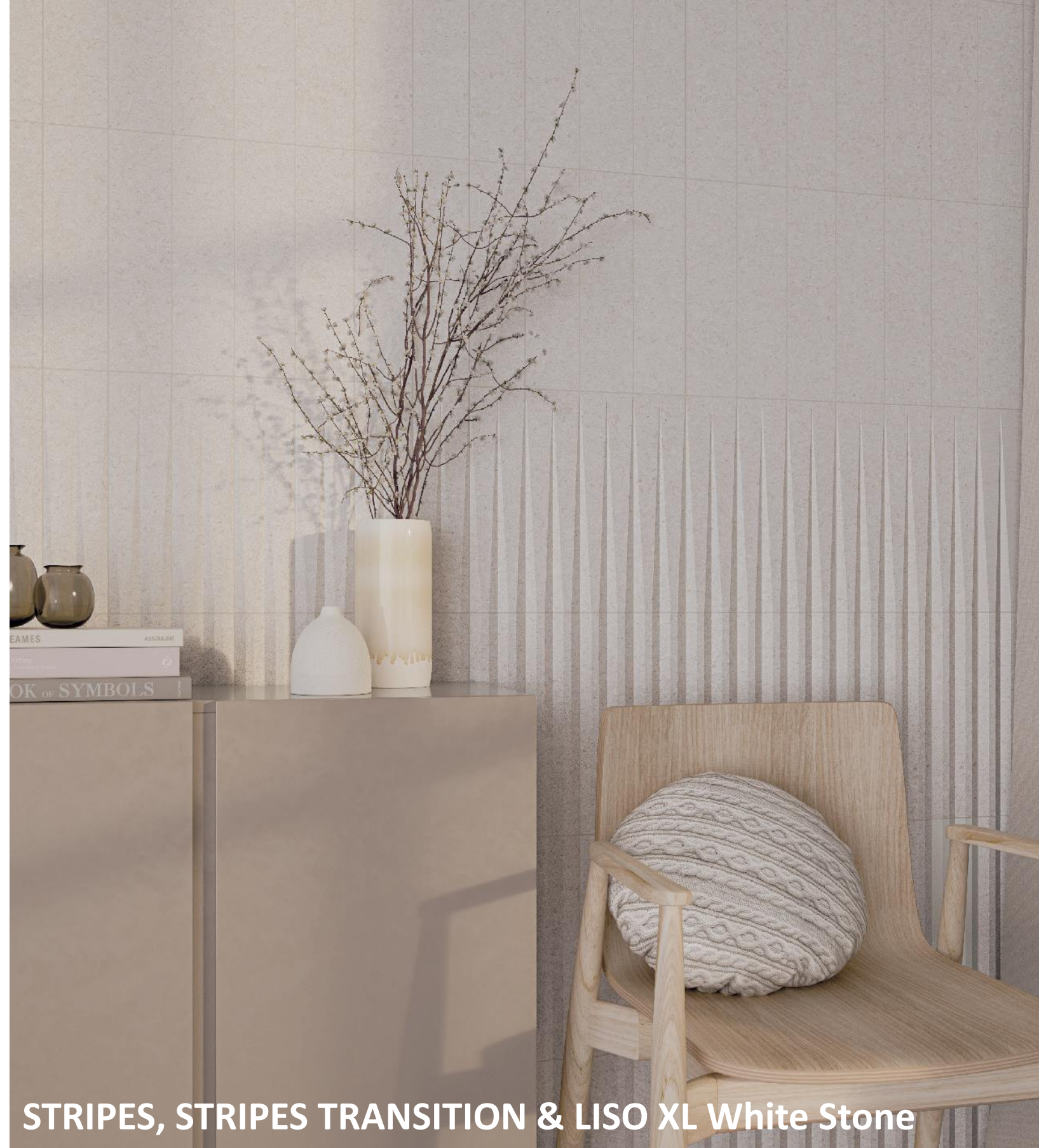
STRIPES, STRIPES TRANSITION & LISO XL White Stone