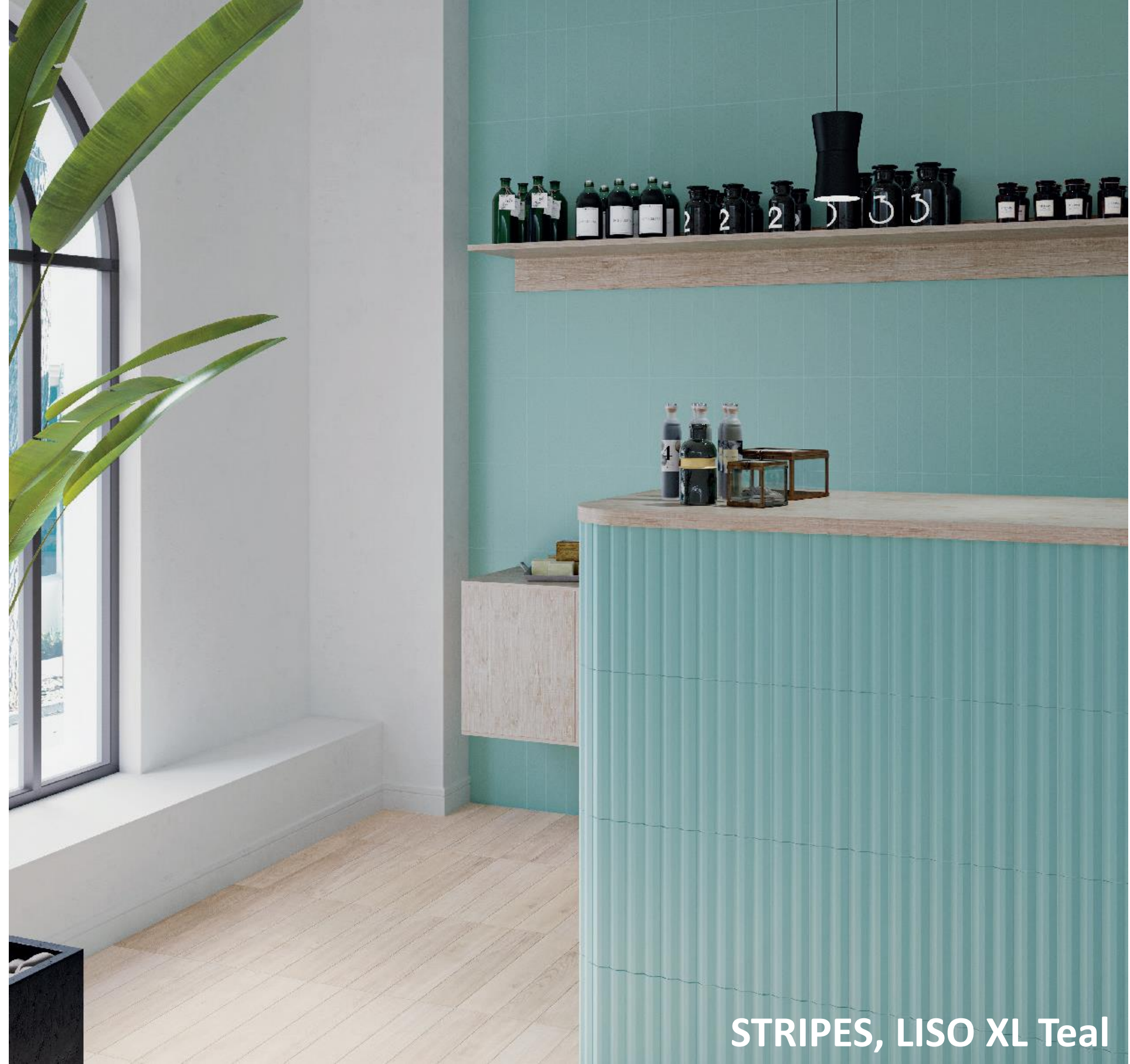
STRIPES, LISO XL Teal