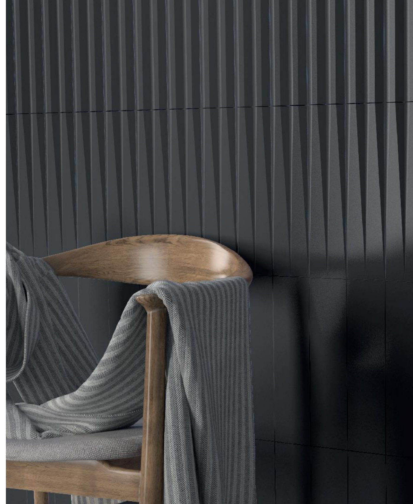
STRIPES, STRIPES TRANSITION & LISO XL Graphite