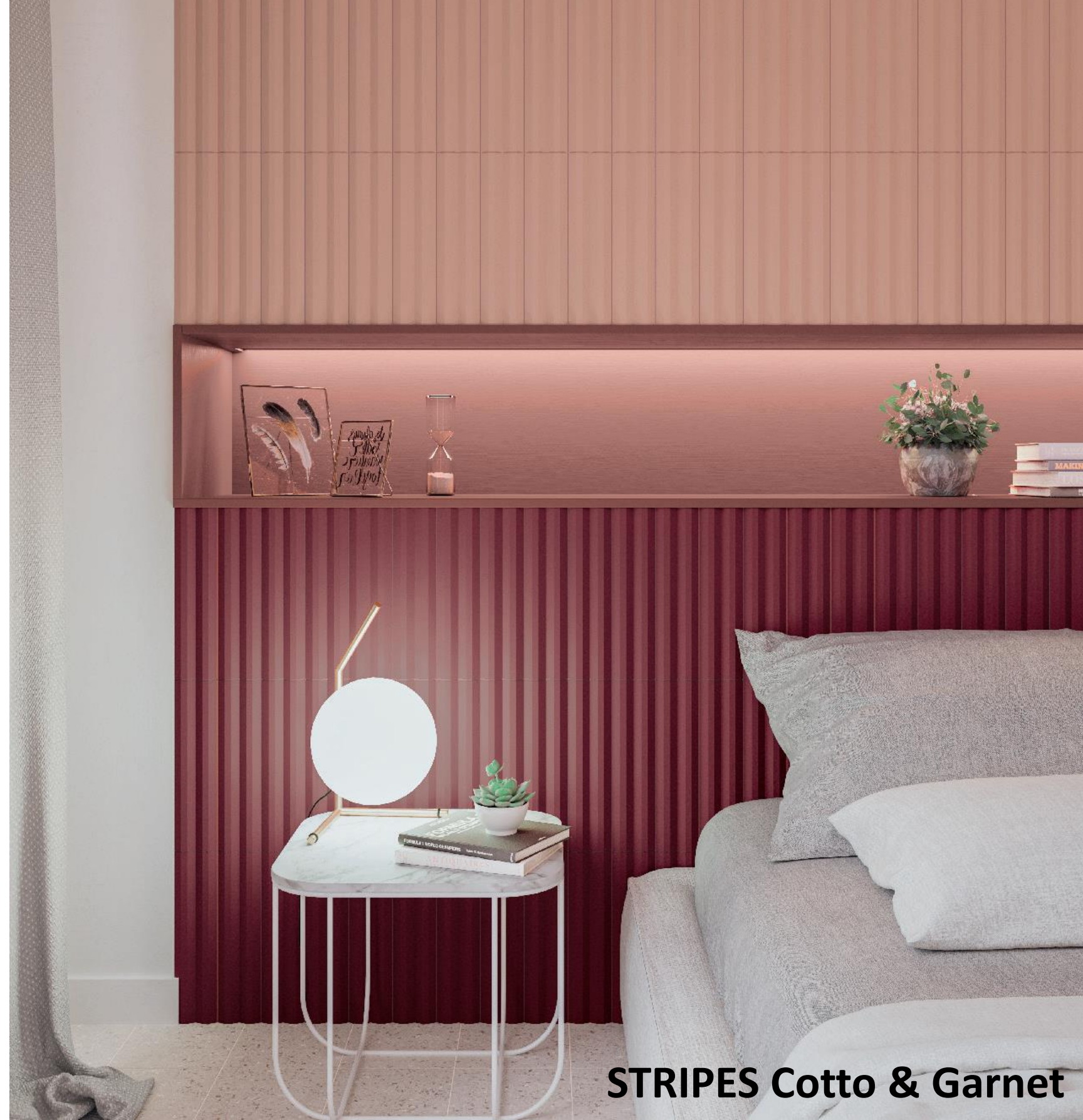
STRIPES Cotto & Garnet