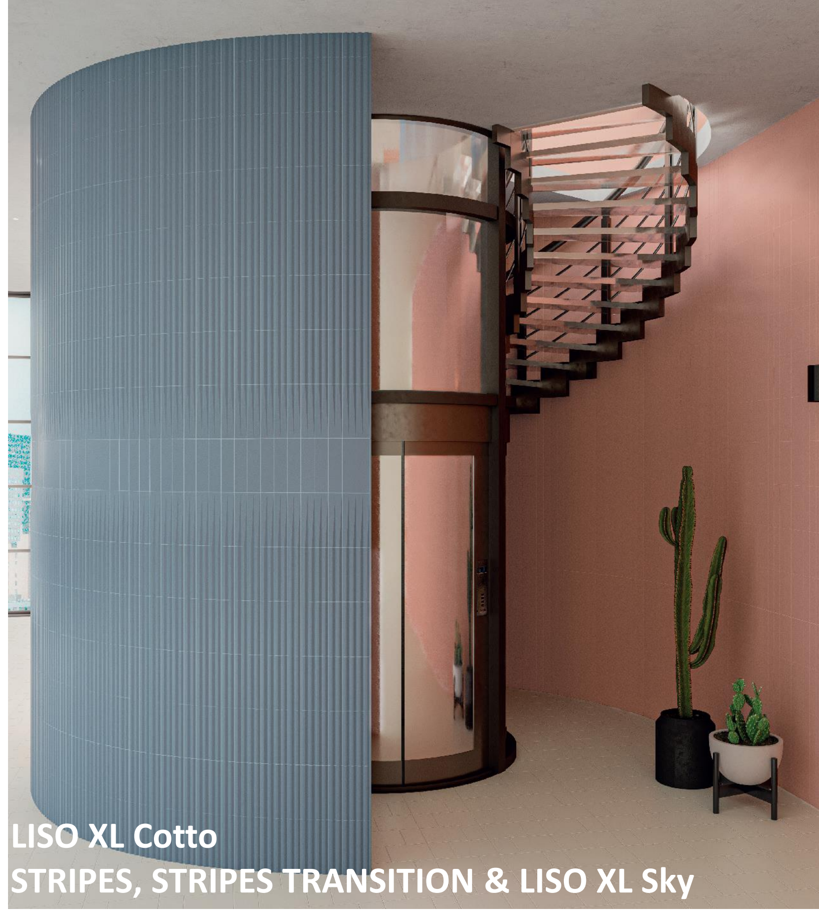
LISO XL Cotto STRIPES, STRIPES TRANSITION & LISO XL Sky