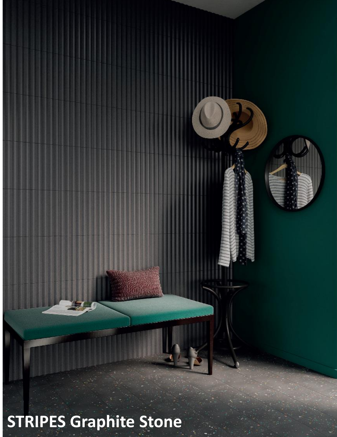
STRIPES Graphite Stone