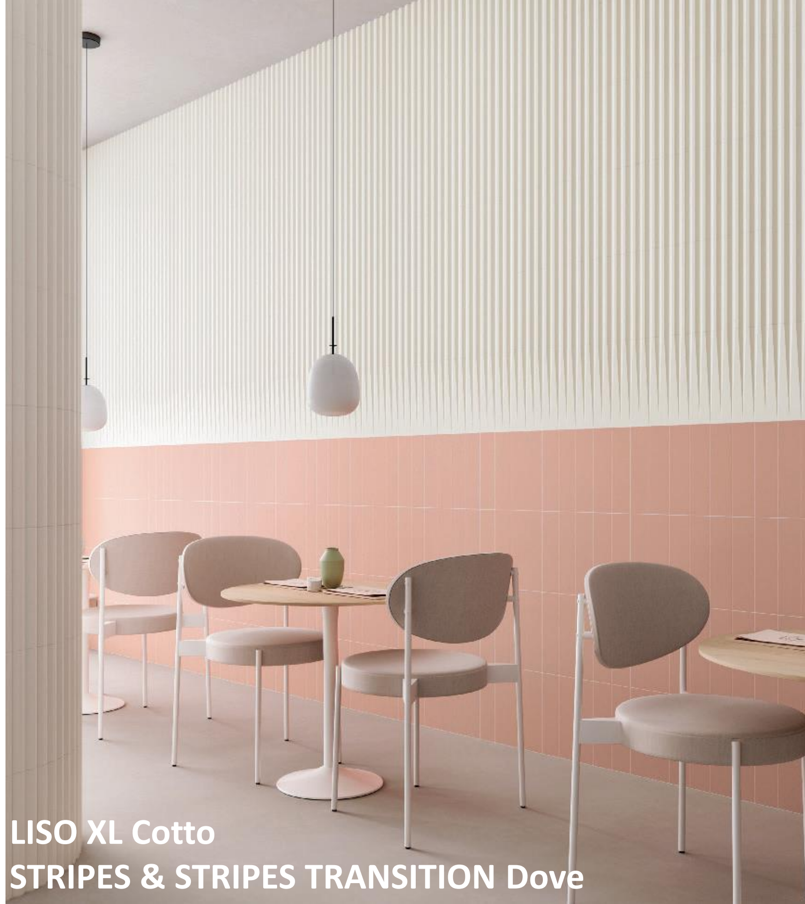
LISO XL Cotto STRIPES & STRIPES TRANSITION Dove