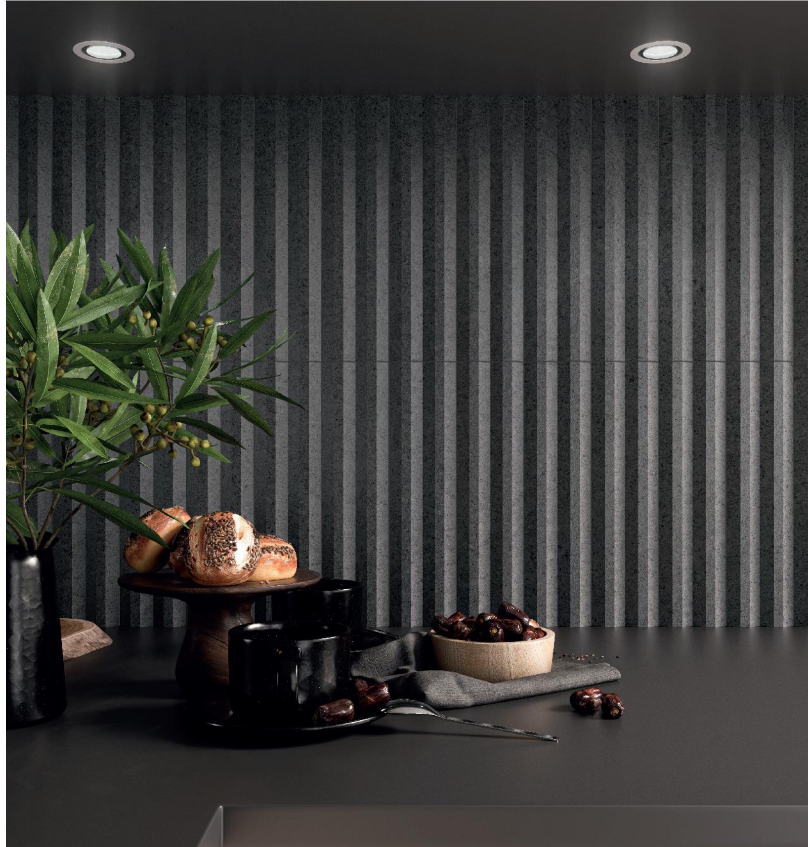
STRIPES Graphite Stone