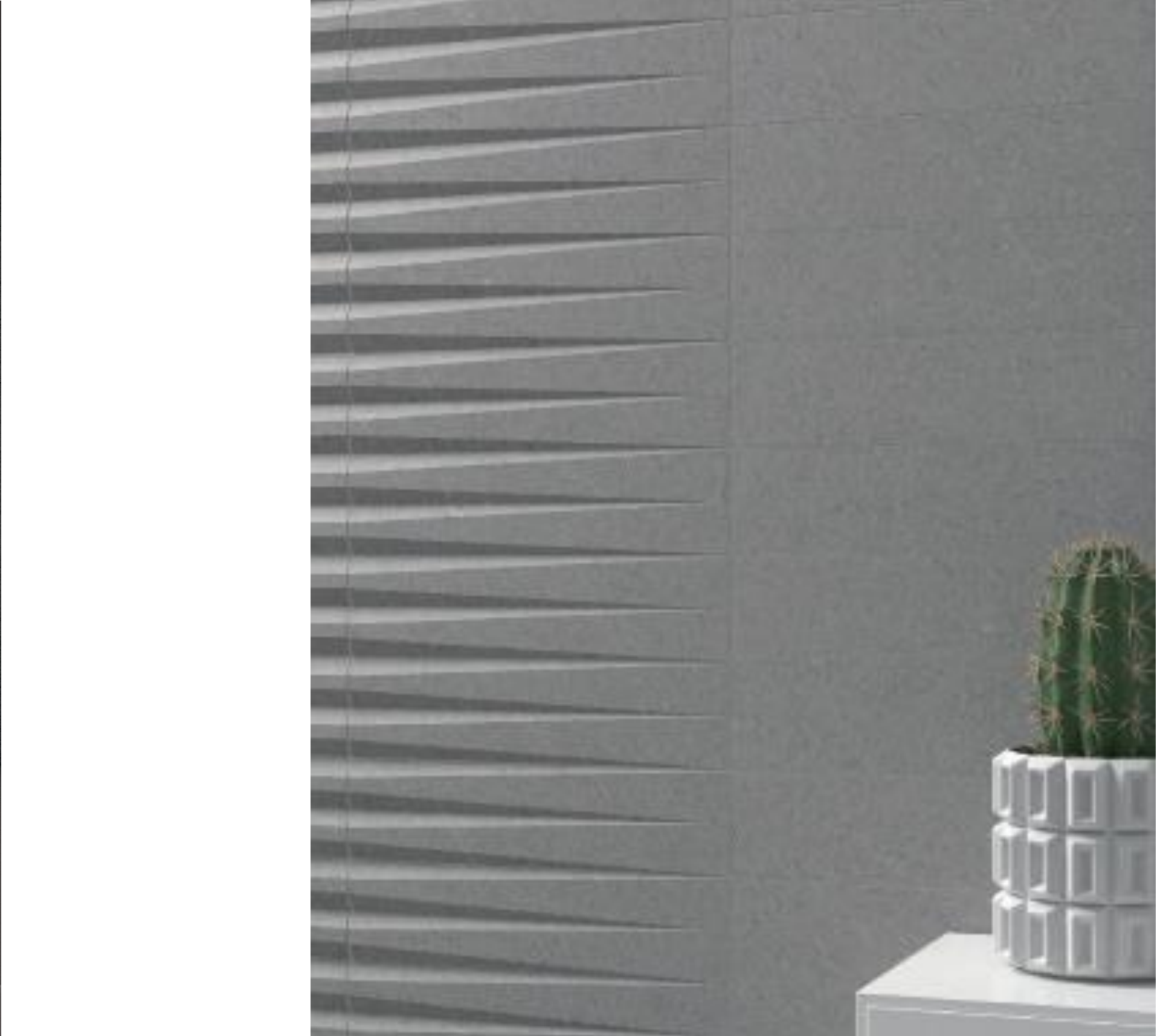
STRIPES TRANSITION & LISO XL Greige Stone