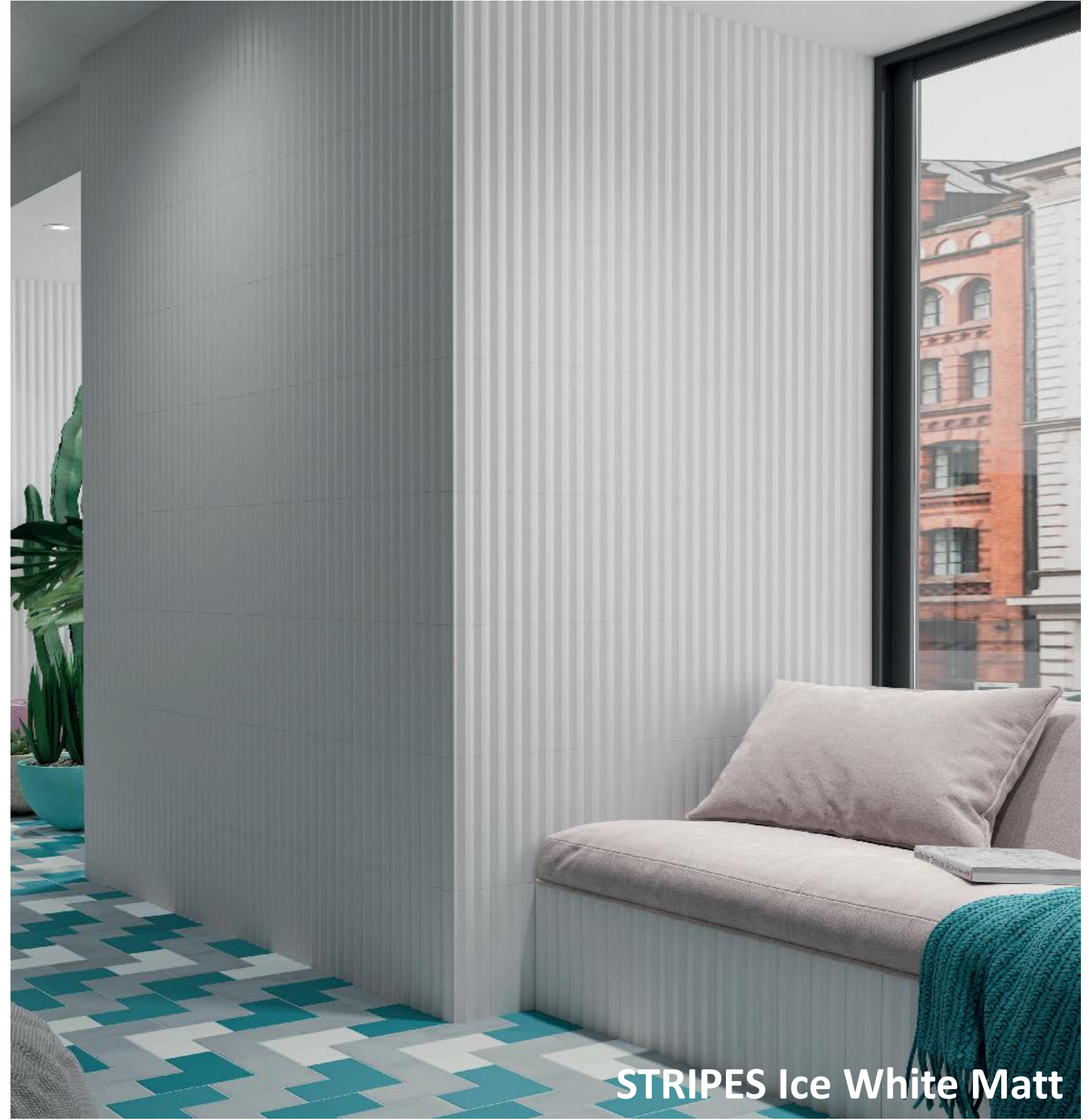
STRIPES Ice White Matt