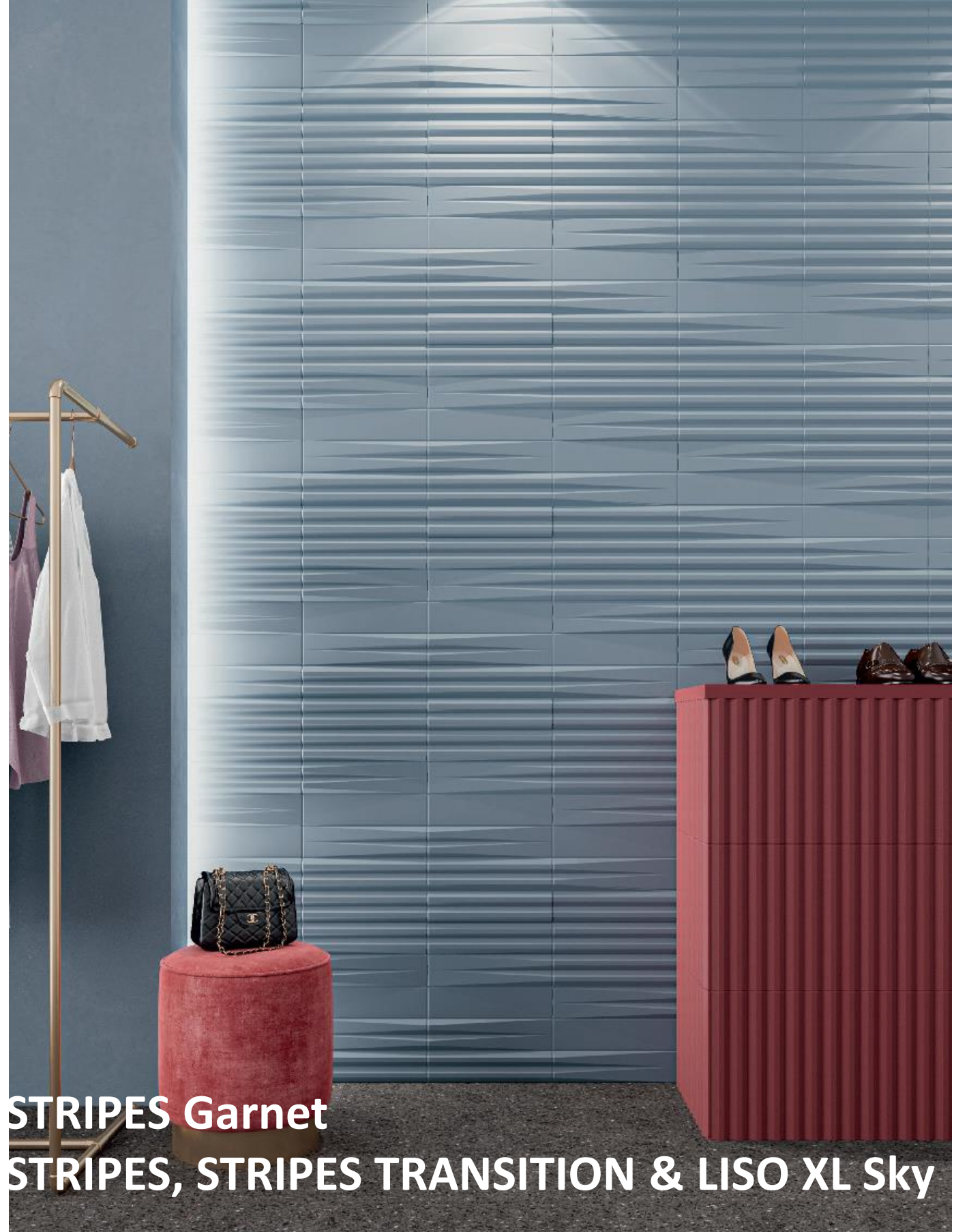
STRIPES Garnet STRIPES, STRIPES TRANSITION & LISO XL Sky