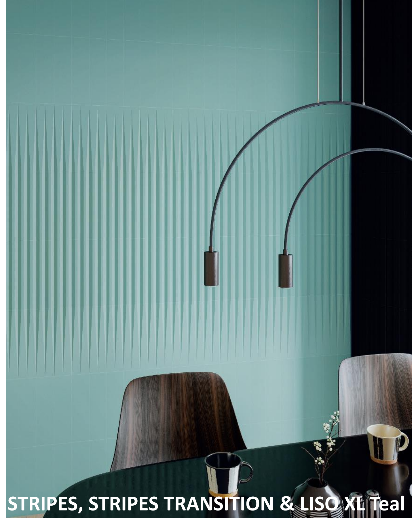
STRIPES, STRIPES TRANSITION & LISO XL Teal