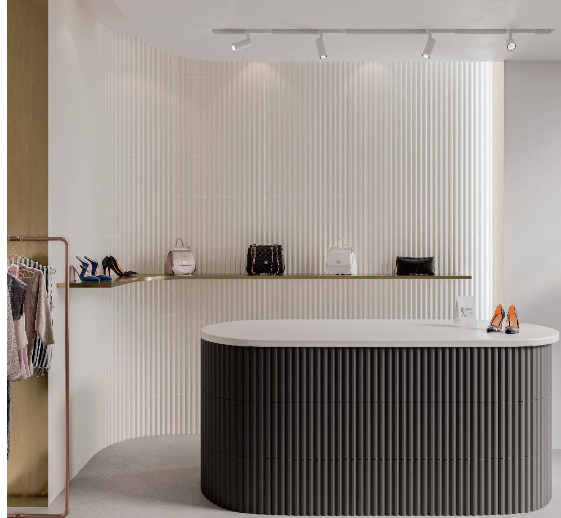
STRIPES Dove & Graphite Matt