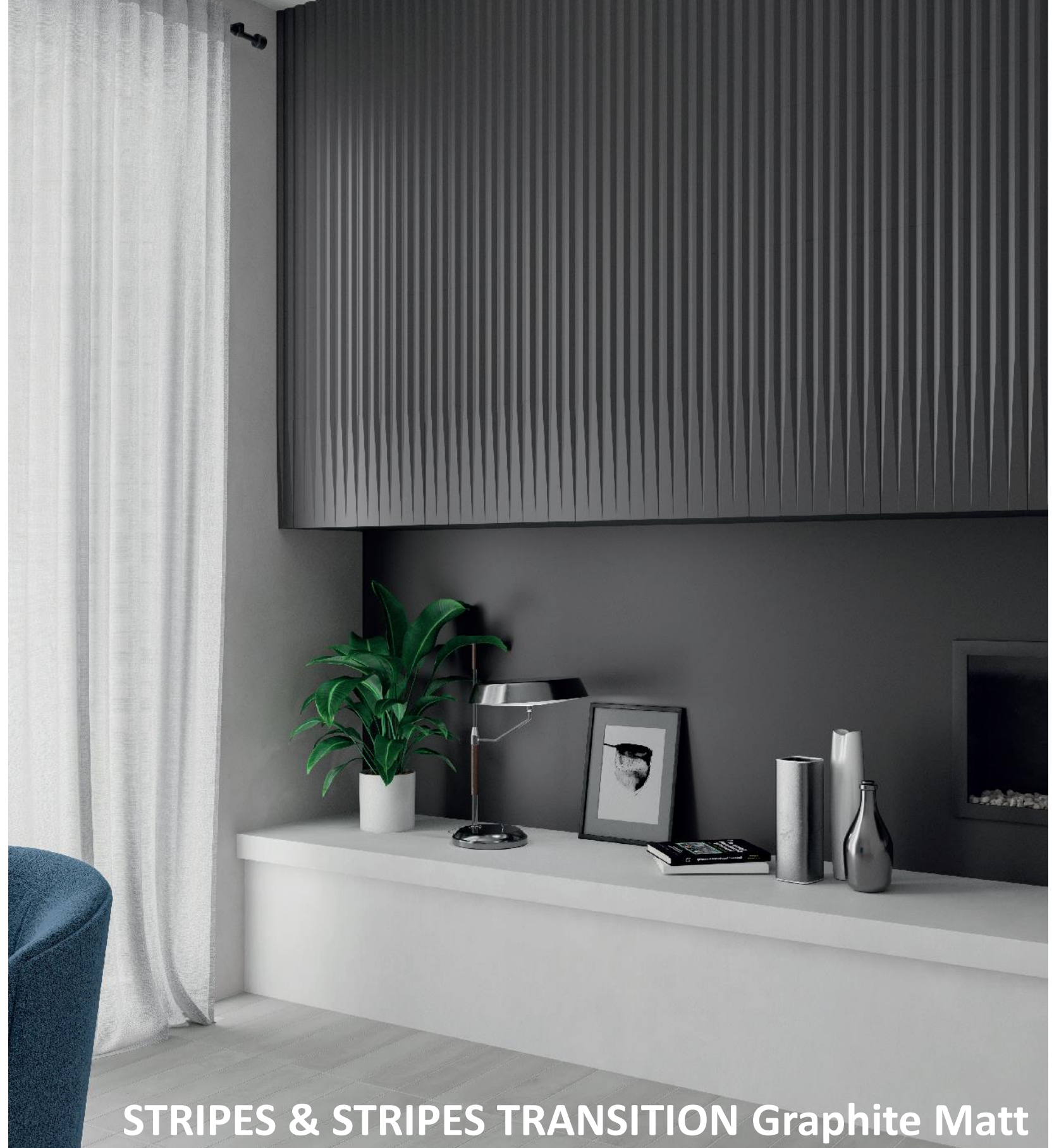
STRIPES & STRIPES TRANSITION Graphite Matt