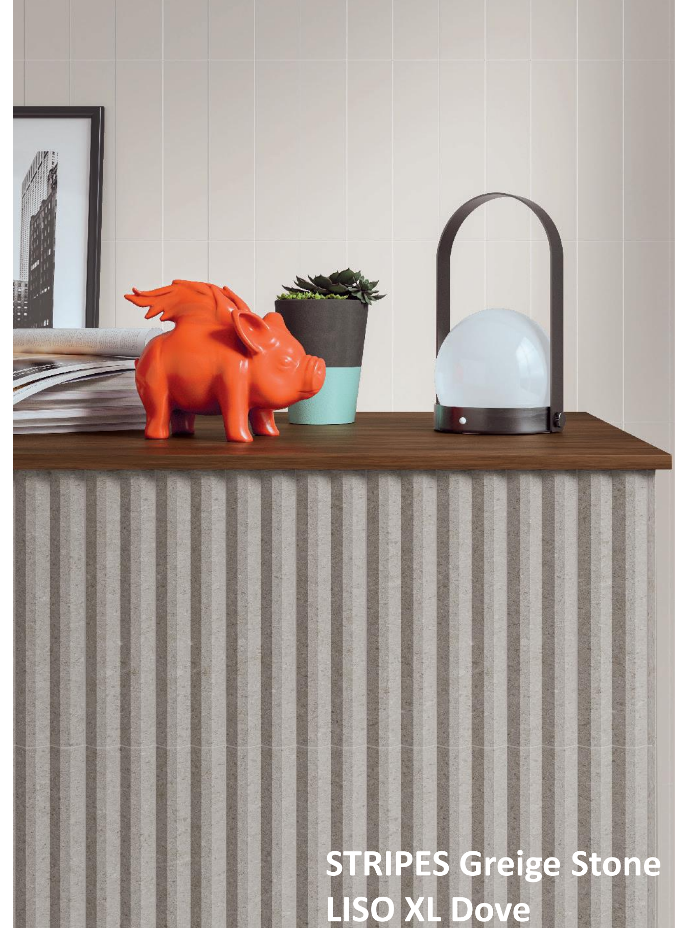
STRIPES Greige Stone LISO XL Dove