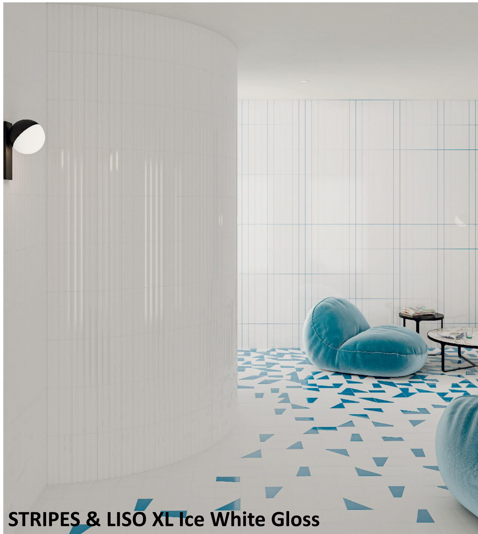
STRIPES & LISO XL Ice White Gloss