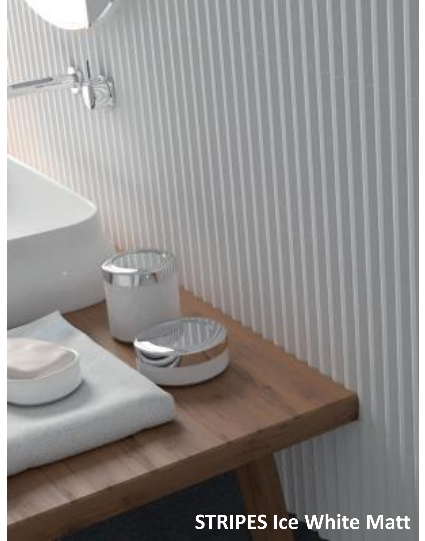
STRIPES Ice White Matt