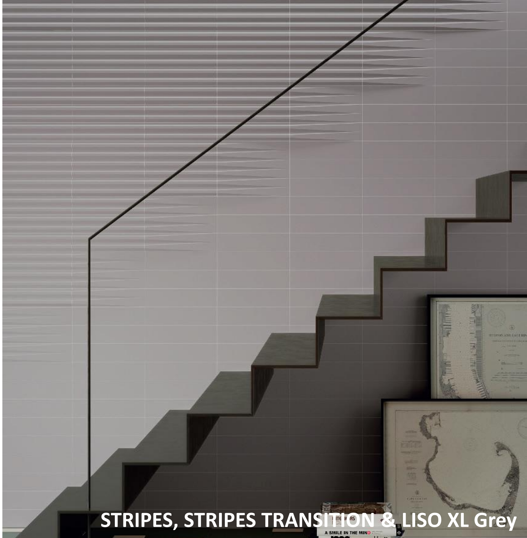
STRIPES, STRIPES TRANSITION & LISO XL Grey